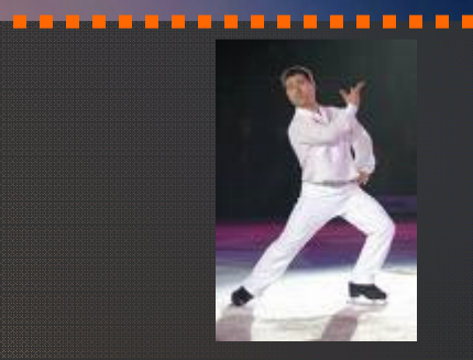
Figure skater Elvis Stojko showcases martial arts skills in 'Star Portraits' By Victoria Ahearn (CP)

TORONTO — Elvis Stojko may be celebrated for his triumphs on the ice, but it's his skill in the dojo that shines through in the new TV series "Star Portraits."